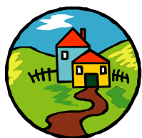
photo of your child with their immediate family which we could put up on display and share (they will all be returned afterwards). This will help us all to get to know each other better and build the children's sense of community.

As you will have seen our topic this term is Homes and Families we would love it if you could bring in a